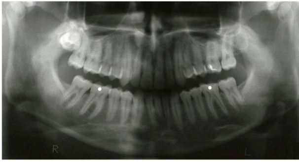
Figure 1 – Panoramic radiograph showing the right upper third molar; the roots are barely visible.

Local infiltration of an anesthetic solution was performed (4% Articaine with Adrenaline 1:200 000 as a vasoconstrictor). A full-thickness triangular flap was raised to gain adequate access, using a horizontal incision along the tuberosity and a vertical releasing incision from the buccal vestibule to the mesial interdental papillae of the second molar. A periosteal elevator was used to elevate the flap, exposing a part of the crown of the impacted third molar and the vestibular cortical bone. The tooth presented a rare and unusual angulation, being horizontally placed, almost perpendicular to the second molar, with the crown facing the cheek. The highest point of the third molar was below the cervical line of the second molar. The bone removal was performed using a straight handpiece and a round surgical bur, irrigated with saline solution. Using elevators to luxate the tooth and avoiding excessive pressure, the surrounding alveolar bone was expanded to allow an unimpeded pathway for tooth removal. Care was taken to avoid fracturing the maxillary tuberosity, displacing the molar into the pterygopalatine fossa or opening the maxillary sinus. After tooth extraction and curettage of the follicular socket, the flap was brought to its original position and the wound was closed with 3-0 silk sutures.