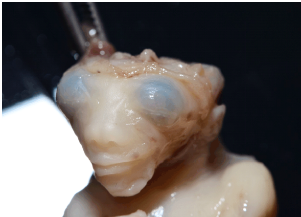
Figure 3 – Detail of the cranium in a 9-week-old anencephalic fetus. Note that the cranial defect is not covered by skin.