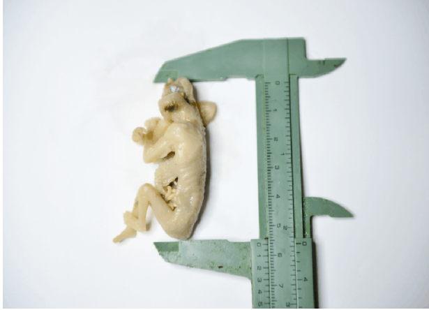
Figure 1 – Demonstrating the significantly reduced crown-rump length in a 14-week-old anencephalic embryo – note that due to the absence of cranium and degeneration of brain the crown-rump length is reduced with two weeks than expected. (Collection of Department of Anatomy and Embryology, Carol Davila University of Medicine and Pharmacy).

of the cephalic region reveals complete absence or abnormal hypothalamic tissue. Neurohypophysis may also be completely absent or present and abnormal. If present, adenohypophysis is usually small and composed of morphologically normal-looking cells. Electron microscopy and immunohistochemistry demonstrate reduced and degenerated corticotrophs.