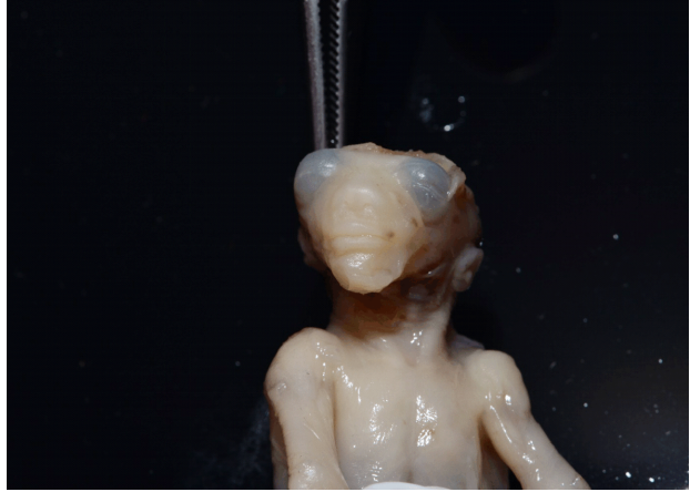
Figure 2 – The appearance of the viscerocranium of a 9-week-old anencephalic fetus (anterior view). (Collection of Department of Anatomy and Embryology, Carol Davila University of Medicine and Pharmacy).