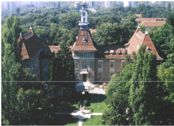
Figure 3 – Aerial view of “Prof. Dr. Alexandru Obregia” Clinical Psychiatric Hospital, Bucharest (2012).

It was built in 16 years and represented an important European progress in public health. It was the largest Psychiatry Hospital in Romania and Europe, having 34 buildings and the possibility to hospitalize 2000 patients at a time [14] (Figure 5).