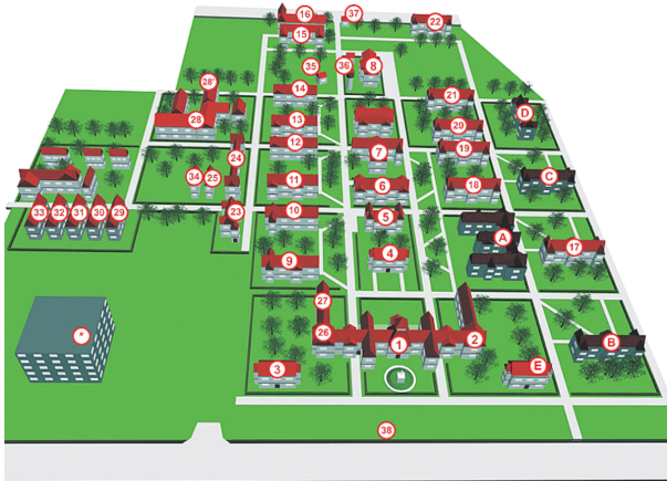
Figure 5 – Current Building Plan of “Prof. Dr. Alexandru Obregia” Clinical Psychiatric Hospital, Bucharest; currently can hospitalize 1229 patients at a time. 1: Administrative Building; 2: Psychiatry IV (75 beds); 3: On-call Room & Patient Admission Office (15 beds); 4: Pharmacy; 5: Administrative Building & Kitchen; 6: Administrative Building; 7: Pediatric Neurology I (40 beds); 8: Maintenance Building; 9: Psychiatry X (70 beds); 10: Psychiatry I (75 beds); 11: Psychiatry II (60 beds); 12: Psychiatry VI (75 beds); 13: Psychiatry VII (70 beds); 14: Psychiatry VIII (70 beds); 15: Psychiatry XV (70 beds); 16: Psychiatry XI (80 beds); 17: Infantile Psychiatry Va (35 beds); 18: Psychiatry XIV (65 beds); 19: Psychiatry XII (72 beds); 20: Psychiatry XIII (50 beds); 21: Pediatric Neurology II (40 beds); 22: Infantile Psychiatry Vb (35 beds); 23: Pediatric On-call Building; 24: Para-clinical Investigations Building; 25: Garage; 26: Psychiatry XVI – Toxicomania (25 beds); 27: Psychiatry XVII – Toxicomania (34 beds); 28: Psychiatry IX (90 beds); 28*: Psychiatry III (83 beds); 29, 30, 32, 33: Storage Building; 31: Kinetotherapy; 34: Archives; 35: Autonomous Water Source; 36: Water Tower; 37: “Emil Racoviță” Gate; 38: Berceni Street Gate – A: National Institute of Neurology and Neurovascular Diseases; B: Vascular Neurology; C: Administration Building; D: Morgue; E: Ambulatory; * “Bagdasar-Arseni” Emergency University Hospital.

It was built in 16 years and represented an important European progress in public health. It was the largest Psychiatry Hospital in Romania and Europe, having 34 buildings and the possibility to hospitalize 2000 patients at a time [14] (Figure 5).