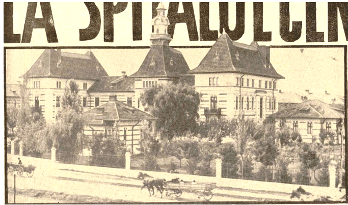
Figure 4 – Wagons on Berceni Street, in front of the main building of Central Hospital for Mental and Nervous Diseases in Bucharest (“Ilustrațiunea Română”, 16 September 1936).