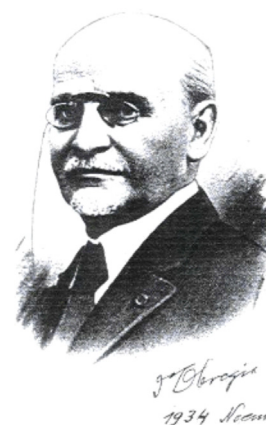
Figure 1 – Alexandru Obregia, portrait with autograph (1934).

The next discovery, in chronological order is the invention of the suboccipital puncture of cisterna magna by Romanian doctor and scientist, Alexandru Obregia (1860–1937) (Figure 1).