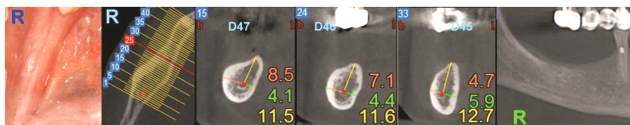
Figure 2 – CBCT: right (R) hemi-mandible. Bucco-lingual sections at the level of the premolar, first and second molar regions. Orange – MC-BS distance; yellow – MC-AS distance; green – MC-LS distance. CBCT: Cone-beam computed tomography; MC-BS distance: Distance between the mandibular canal and the buccal (lateral) surface of the mandible; MC-AS distance: Distance between the mandibular canal and the alveolar surface of the mandible of the level of the premolar, first and second molar regions; MC-LS distance: Distance between the mandibular canal and the lingual (medial) surface of the mandible.