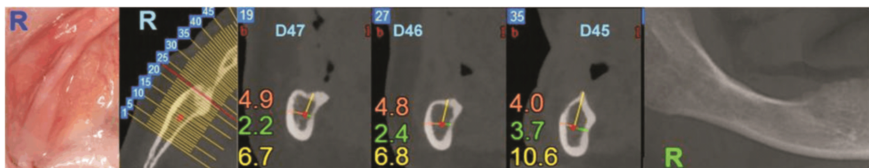
Figure 1 – CBCT: right (R) hemi-mandible. Buccal-lingual sections at the level of the premolar, first and second molar regions. Orange – MC-BS distance; yellow – MC-AS distance; green – MC-LS distance. CBCT: Cone-beam computed tomography; MC-BS distance: Distance between the mandibular canal and the buccal (lateral) surface of the mandible; MC-AS distance: Distance between the mandibular canal and the alveolar surface of the mandible of the level of the premolar, first and second molar regions; MC-LS distance: Distance between the mandibular canal and the lingual (medial) surface of the mandible.

In the following Tables (1–6), statistically processed analysis of the three studied parameters can be observed. It must be noted that N – No. of cases, SD – Standard deviation, SE – Standard error, and 95% CI – 95% Confidence interval for the average.