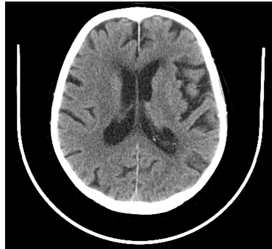
Figure 3 – CT image of dementia patient with large ventricles and cortical atrophy.

In our current practice, we use computer tomography, which shows cortical atrophy (Figure 3).