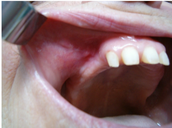
Figure 3 – The post-excisional scar area.

Post-surgical removal, on the buccal slope of the right maxillary residual ridge, in the canine-premolar area resulted a mucosal scar area of about 2 cm in length, not capable of supporting the prosthetic pressure (Figure 3).