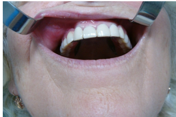
Figure 5 – The partial removable prosthesis in the oral cavity.