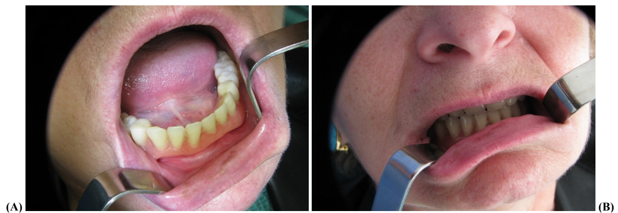
Figure 8 – Mandibular complete dentures in the oral cavity (A) and the final aspect of the prosthetic treatment (B).