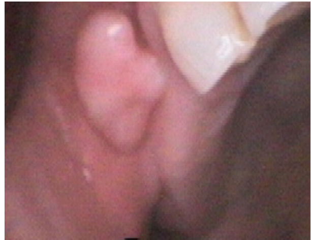
Figure 1 – The tumor formation on the buccal slope of the edentulous maxillary ridge.

The tumor formation positioned on the buccal slope of the right maxillary residual ridge is an obstacle for prosthetic rehabilitation.