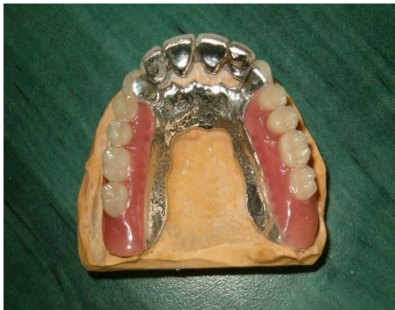
Figure 4 – The removal partial prosthesis on the model.

In the prosthetic choice, along with considerations regarding the topography and type of edentation, the necessity of protecting the scar area was also considered. The partial removable prosthesis allowed the making of prosthetic saddles with reduced dimensionally margins that protect the area and in the same time insure the necessary mechanical resistance (Figures 4 and 5).